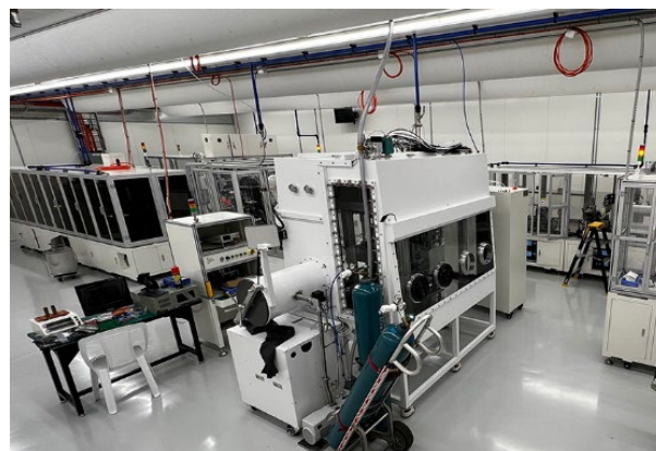
3. Part of the Phase 3 fabrication line inside our dry room

Our Phase 3 line, the largest and most complex pouch cell manufacturing facility in Australia, includes 55 pieces of advanced production equipment. We are now producing 20Ah multi-layer pouch cells on the production line for internal testing.