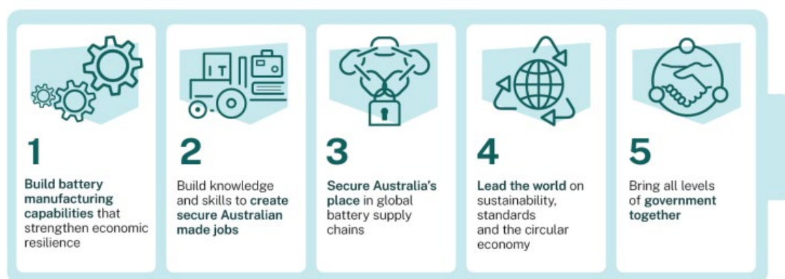
Image source: https://www.industry.gov.au/publications/national-battery-strategy/strategy-glance

The National Battery Strategy underscores the Government’s commitment to a Future – Made in Australia, providing essential government support for competitive, sustainable, vertically integrated, and diverse battery manufacturing capabilities.