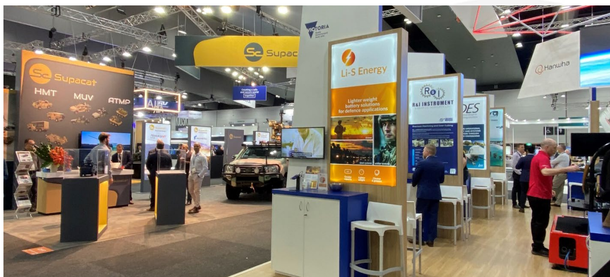
The LIS Energy pod, corner facing as part of the Invest Victoria Pavilion